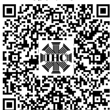
Rotation Violation Report Form