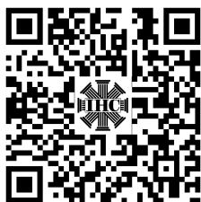
Counseling & Health Services Homepage