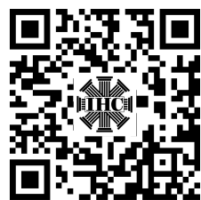
Equity & Title IX Homepage